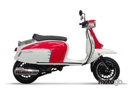
More colours available